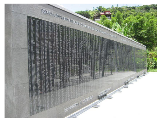
POW Memorial Wall - erected in Honour of the men