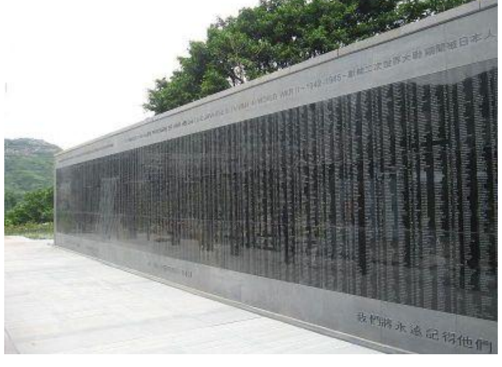
Views of the POW Memorial wall looking both ways – over 4350 former prisoners of war are remembered here.