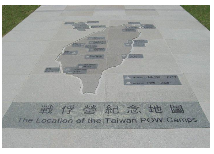
Map of Taiwan etched in granite showing the location of all the former Taiwan POW Camps

The purpose of the sculpture is to compliment the beautiful memorial wall in the park by showing people now - and in future generations, an image of the POWs, so they may better envision the suffering and sacrifice endured by those men to bring us the freedom that we enjoy today. . .